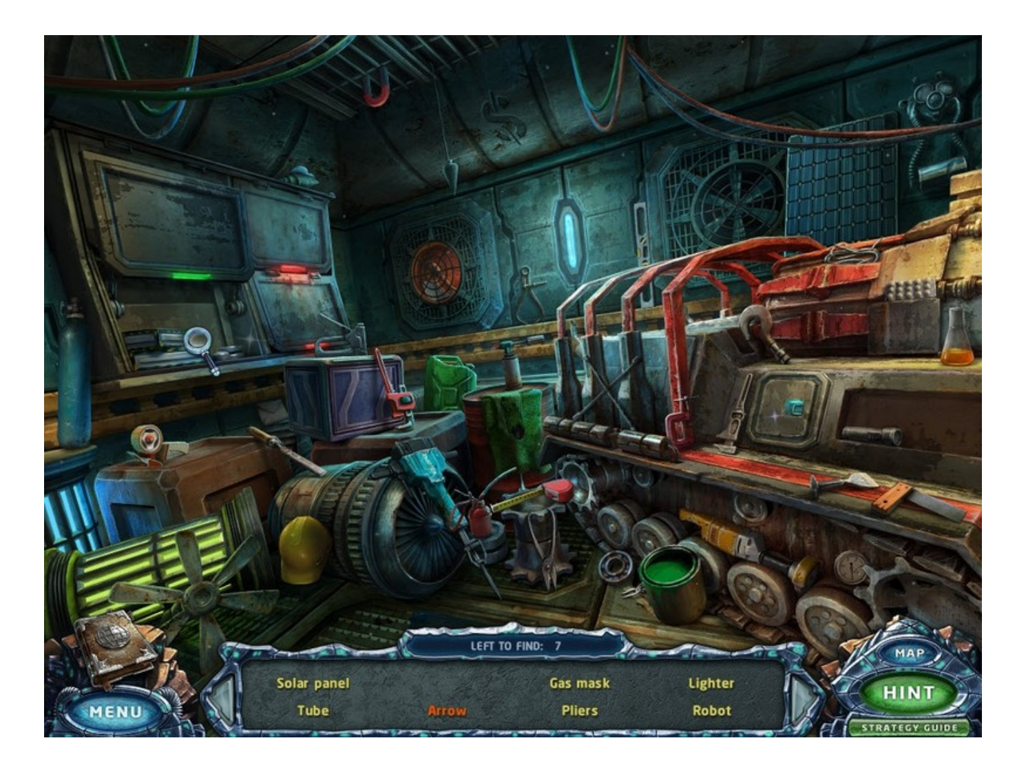
Eternal Journey: New Atlantis Full Crack [full Version]